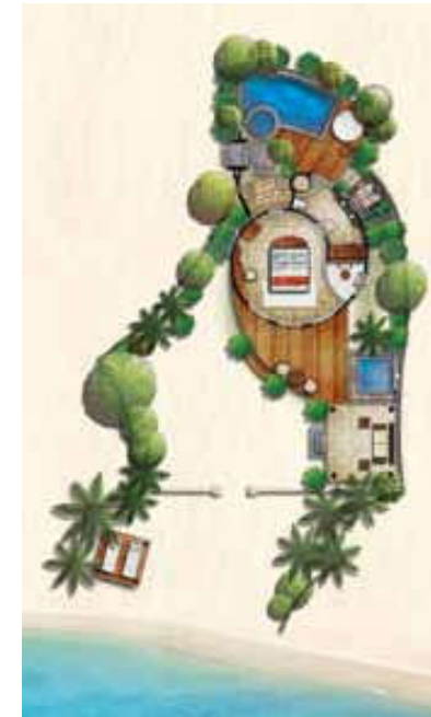
Estimated Floor Area 120sqm All plans are not drawn to scale