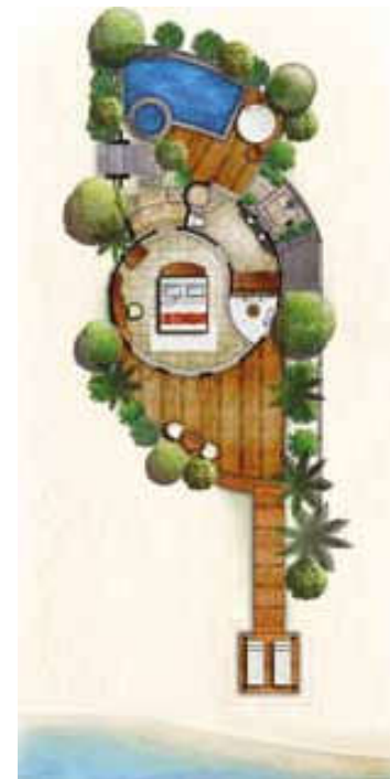
Estimated Floor Area 110sqm All plans are not drawn to scale

The Beachfront Pool Villa delivers unparalleled privacy in a walled garden, which comprises a sundeck, pool, jet pool, outdoor and indoor shower and a recessed sitting area perfect for a lazy afternoon lounging on the sundeck.