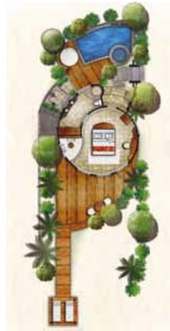
Estimated Floor Area 110sqm All plans are not drawn to scale